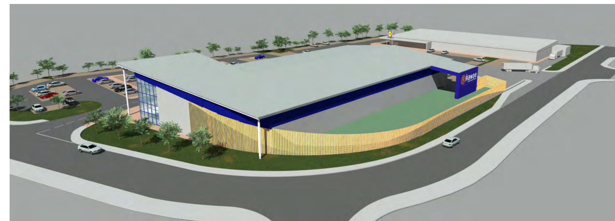
INTEGRATED GARDEN CENTRE SCREEN FENCE

public parking provision 175 cars plus staff 9 cars