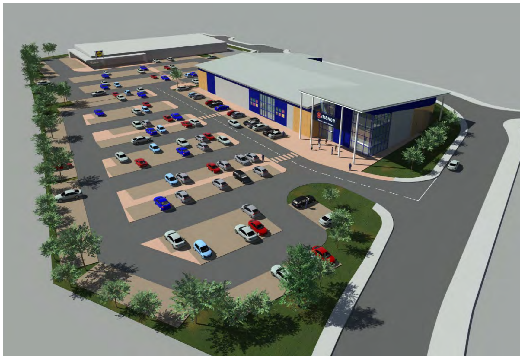
AERIAL VIEW OF DEVELOPMENT