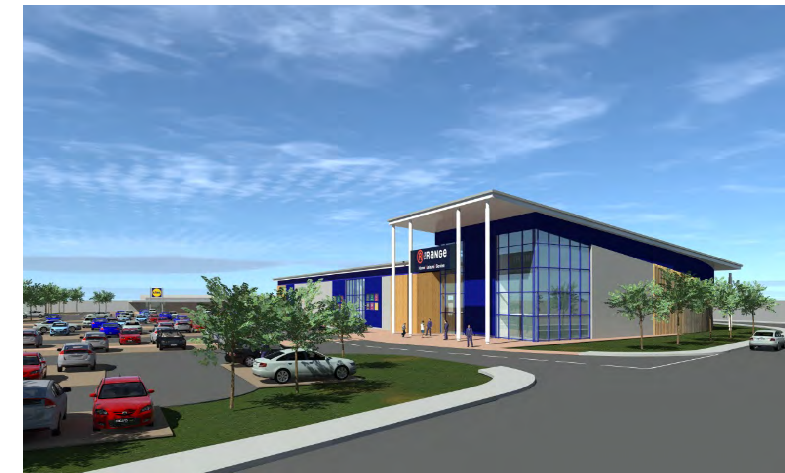
MAIN ENTRANCE - VISUAL IMPACT