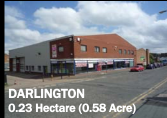
DARLINGTON 0.23 Hectare (0.58 Acre)