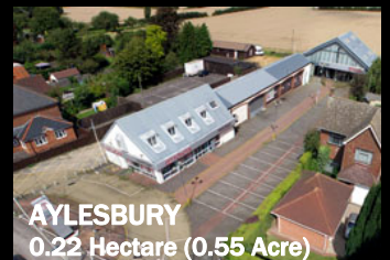
AYLESBURY 0.22 Hectare (0.55 Acre)