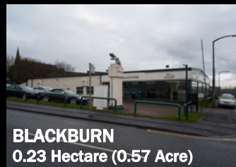
BLACKBURN 0.23 Hectare (0.57 Acre)