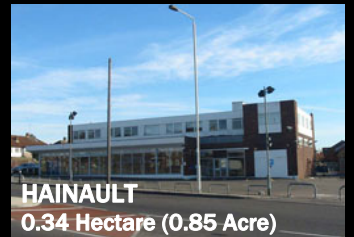
HAINAULT 0.34 Hectare (0.85 Acre)