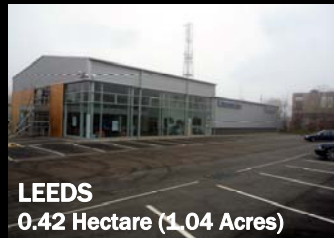
LEEDS 0.42 Hectare (1.04 Acres)