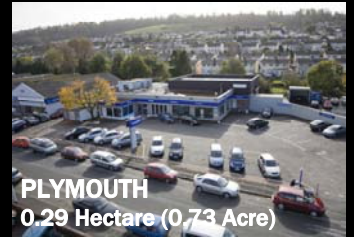
PLYMOUTH 0.29 Hectare (0.73 Acre)