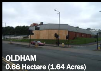
OLDHAM 0.66 Hectare (1.64 Acres)