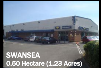
SWANSEA 0.50 Hectare (1.23 Acres)